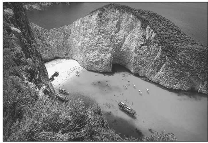
View of Navagio Beach on Zakynthos